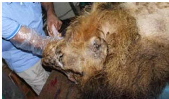
Figure 4: Digital palpation of glottis for intubation

pharyngeal region. The tube was passed into the trachea after depressing the epiglottis with fingers (Figure 4).