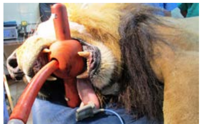
Figure 5: Intubated – Cuffed endotracheal tube with wooden mouth gag in position

The time taken for early orientation characterized by head, neck and fore limb movements, time taken for complete recovery and quality of recovery were recorded from the time of discontinuation of administration of isoflurane. The quality of recovery was scored (Wenger et al., 2010) between 1 and 4 based on transition from lateral to sternal recumbency, ataxia, number of attempts to stand and nature and duration of recovery.