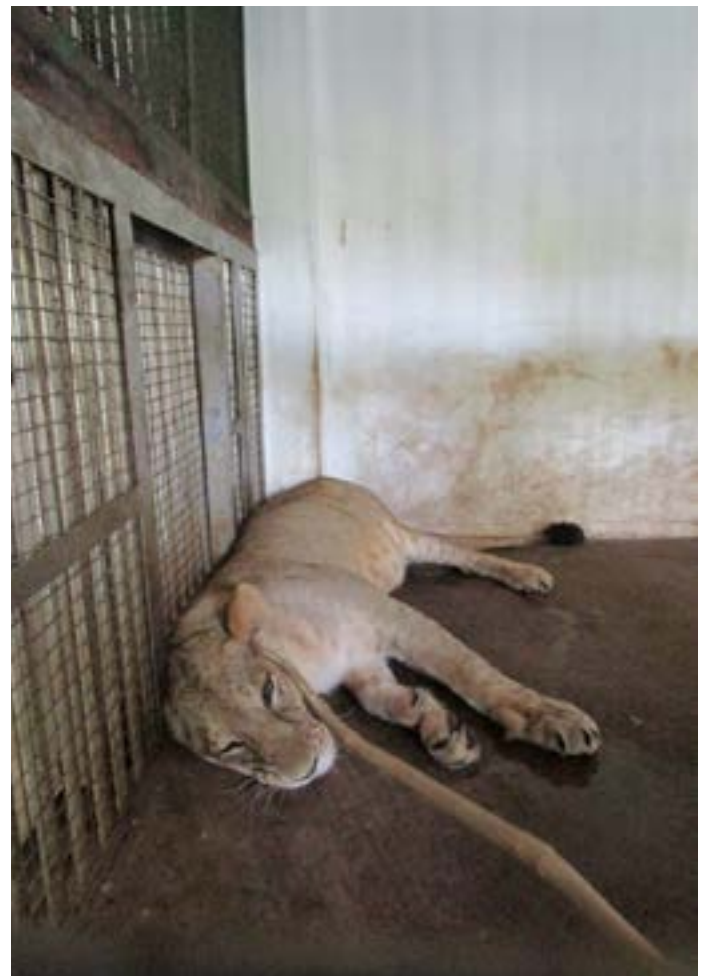
Figure 1: Stimulation of ear flick reflex after immobilization

Once the animals attained lateral recumbency, they were approached from outside the cage and the pinna was gently stimulated with a stick, sufficiently to stretch the auricular muscles to elicit the ear twitch reflex (Figure 1) and the ear flick reflex was scored (Gatesman and Wiesner, 1982). Score 1: Unsatisfactory - The animal could actively move its limb and even stand up when the ear pinna was stimulated, Score 2: Light level - Ear twitch was present and feeble movements could be noticed and Score 3: Satisfactory - Absence of ear twitch reflex. Additional incremental doses of xylazine and ketamine were administered to achieve recumbency and immobilization characterized by absence of ear flick reflex, if required. The time taken in minutes for complete absence of ear flick reflex following darting was recorded. The data were compared between the young and adult lions.