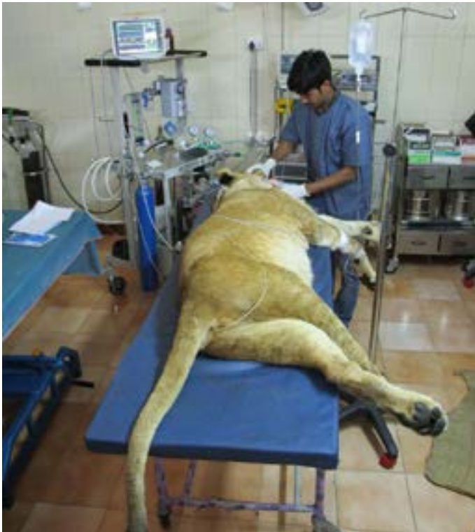
Figure 6: Monitoring of anaesthesia with vital signs monitor

Rectal temperature in degrees Celsius ( ^{\circ}\text{C} ), heart rate, respiration rate, electrocardiogram and saturated percentage of oxygen were recorded after immobilization, after induction, during maintenance (Figure 6) and before release into the cage (before recovery) and compared between groups.